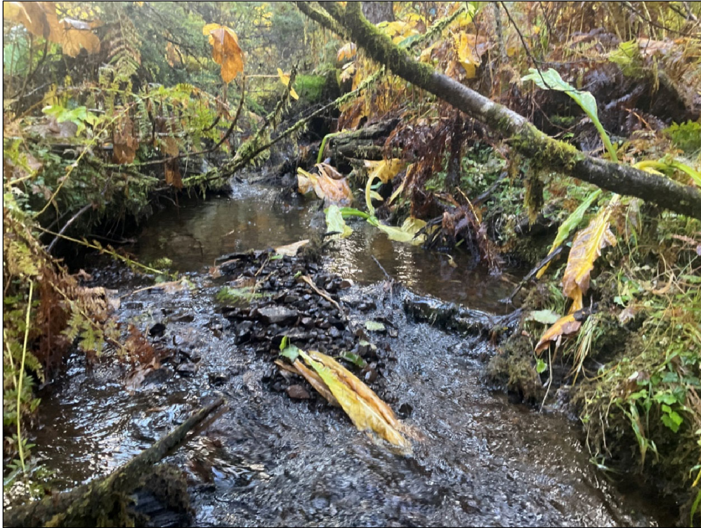
Figure 1.—Channel at waypoint 883.