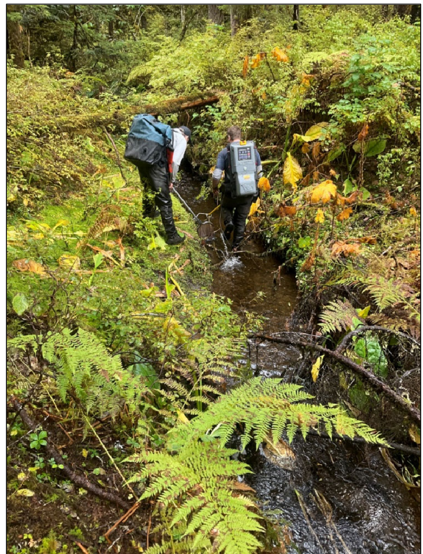
Figure 3.—Staff electrofishing at waypoint 874.