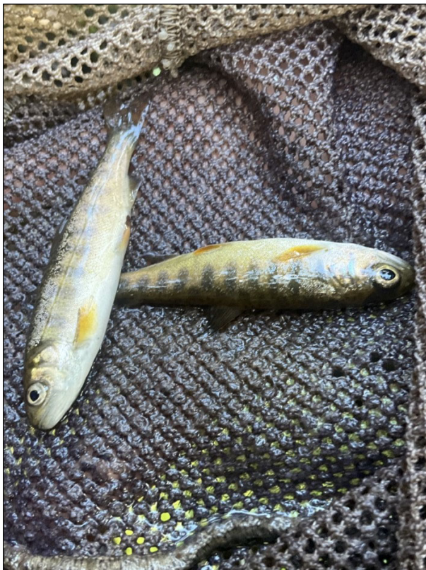
Figure 2.—Juvenile coho salmon captured at waypoint 883.